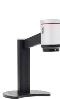
U30 with Antistatic body

U30s, a stand-alone, totally configurable system with a variety of mounting solutions. Select between any of Inspectis' Boom type, XY-type or Articulated arm stands.