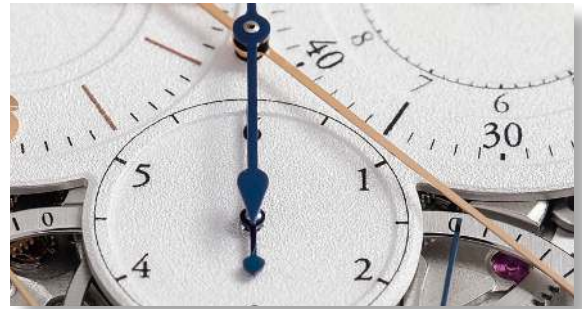
Micro mechanics, x7.6 Zoom, 12x Mag.