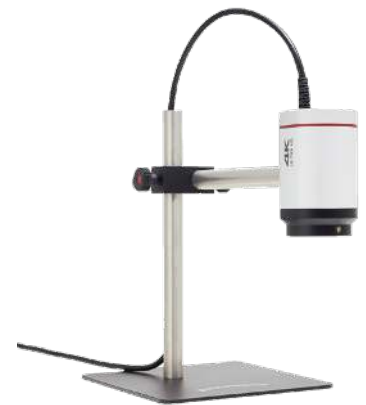
U30s with Single-arm Boom Stand

"Designed according to Industry Standards"