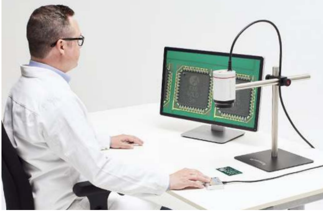
U30s, Stand-alone 4K system with Single-arm Boom Stand

Inspectis Ultra HD digital microscopes provide relief to eyes, neck and shoulders through the unique ergonomic design and 228 mm free working distance. By allowing operators to sit comfortably in a good working position, their inspection tasks can be carried out more efficiently.