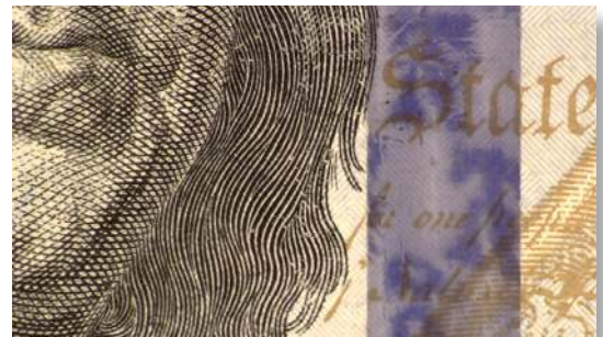
Forensic, x20 Zoom, 31x Mag.

” Optimised for Accurate Inspection of Medical Devices ”