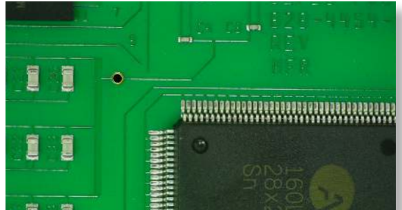
Electronics PCB, x6 Zoom, 11.5x Mag.

The system's standard optics with 1.9 - 56x magnification (24" monitor) are comparable to common inspection microscopes. If further magnification is needed, a wide range of +1, +2, +3, +5 and +10 diopter Macro Lenses can be added to magnify up to 170x.