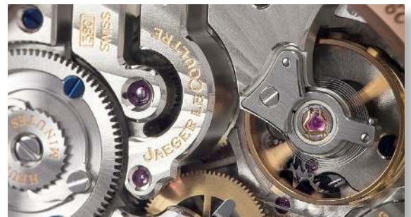
Micro mechanis, x10 Zoom, 19x Mag.