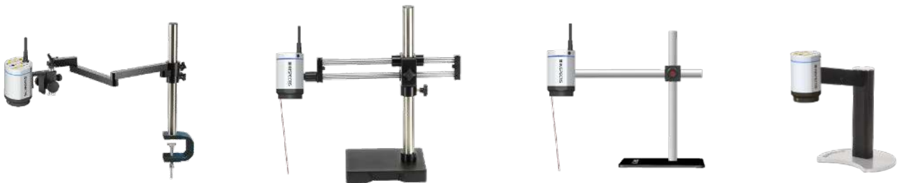
F30s with Articulated Boom Stand

Modular design of F30s allows easy configuration of your optical inspection system with a wide range of stands and mounts according to your needs.