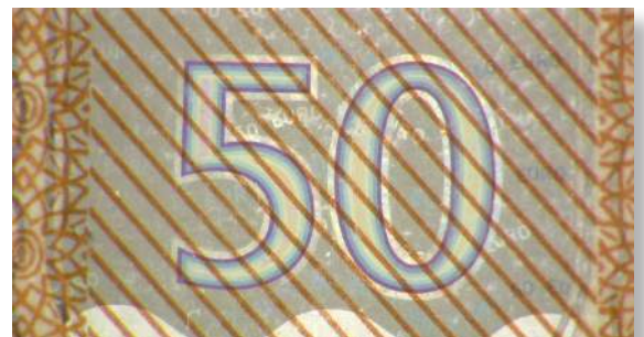
Forensic, x25 Zoom, 48x Mag.

Connect F30s digital microscope to a Full HD display or your PC via Inspectis' plug-&-play USB3.0 converter and take advantage of the astonishing image resolution, high contrast, true colours at 1:30x zoom range in your optical inspection work.